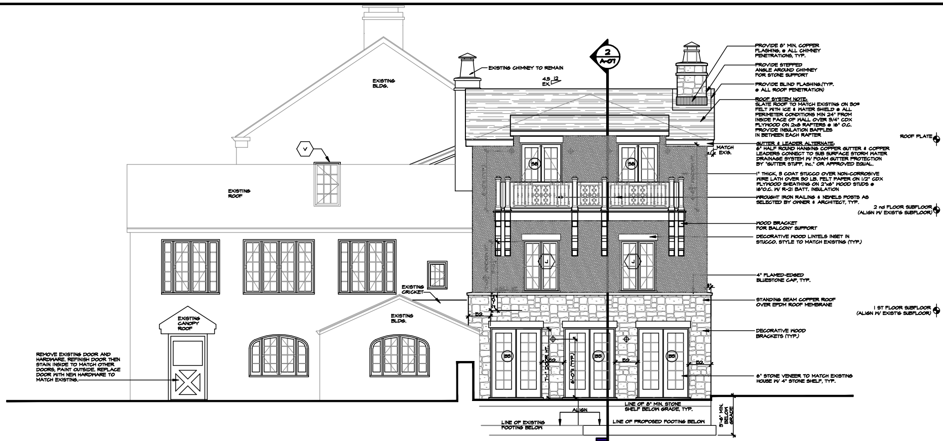
02 PROPOSED LEFT SIDE ELEVATION SCALE: 1/4" = 1'-0"