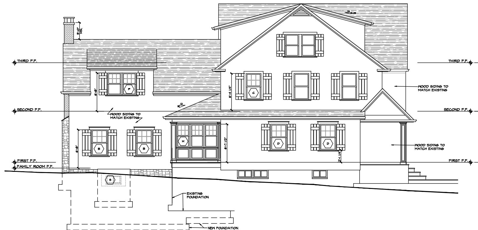
02 LEFT SIDE ELEVATION SCALE: 1/4" = 1'-0"